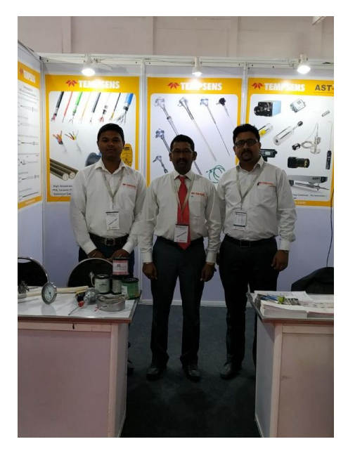
Elektrotec 2019 24th to 27th January 2019, Coimbatore, Tamil Nadu - India