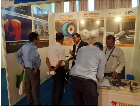
AITISM 2019 17th to 19th October Ranchi Jharkhand - India