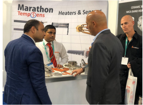
K Fair 2019 16th to 23rd October Dusseldorf Germany