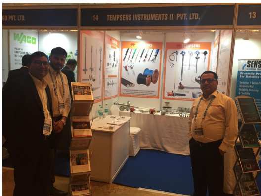
Pertoleum and Power Automation Meet 2019