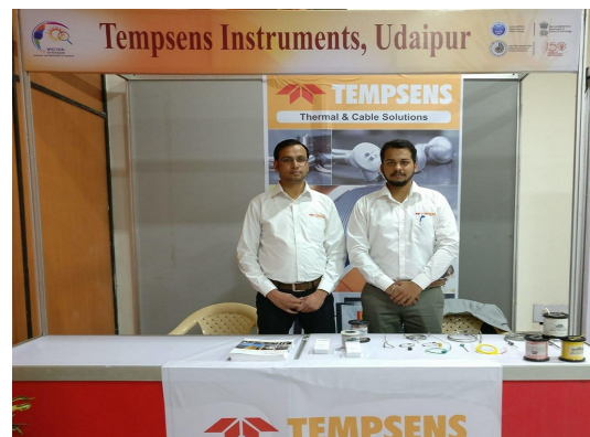
Vigyan Samagam 2019 8th to 9th May 2019