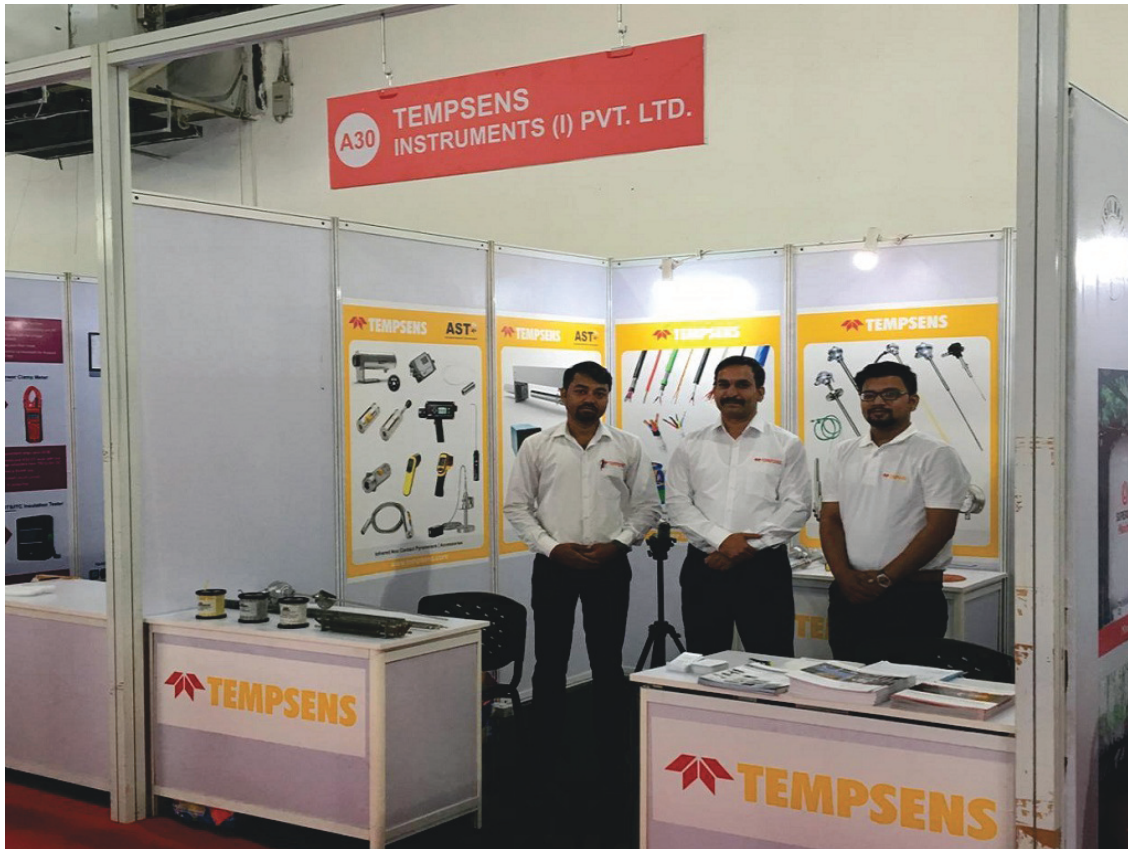
Globetech Engineering Expo 2019 24th to 26th May 2019 Pune - India