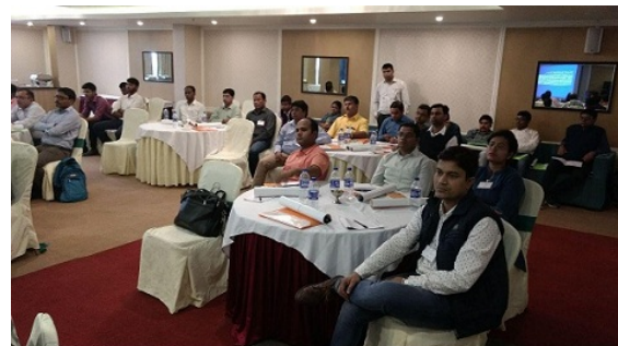
20th Nov. 17 at Delhi