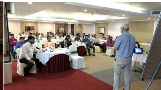
22nd Nov. 17 at Kolkata