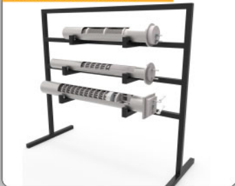
Bundle Rod Heaters & Radiant Tube