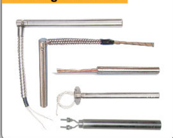
High Watt Density Cartridge Heaters